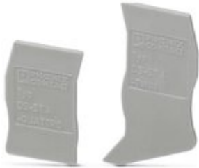
Cover segment, length: 87 mm, height: 36.5 mm, color: gray

Please be informed that the data shown in this PDF Document is generated from our Online Catalog. Please find the complete data in the user's documentation. Our General Terms of Use for Downloads are valid ( http://phoenixcontact.com/download )